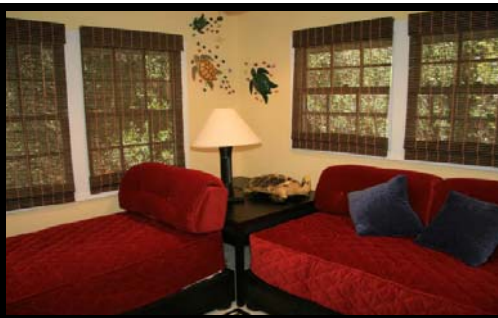
Turtle Bedroom, Twin Beds