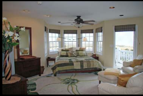
Master Bedroom, King Bed Georgia O'Keefe Rug, View Balcony