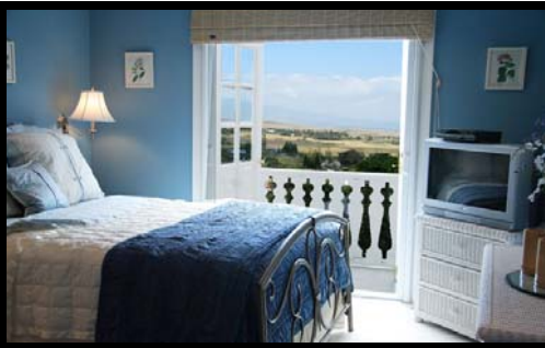
Blue Bedroom, Queen Bed View Balcony