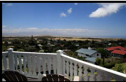
Kohala Coast View

Check Availability Online: www.WaimeaVilla.com