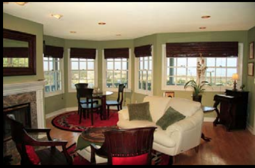
Living Room w/ Fireplace Game-Table Turret Area

■ Amenities include: SLEEPS 6 PEOPLE; Free mainland long distance telephone , 57" Plasma TV & DVR in Media Room, Flat-Screen TVs in all bedrooms, All+Pay Channel Cable TV, Stereo CD, 3 DVDs, formal Dining Room, Living Room with Game-Table & wood-burning fireplace, Gourmet Kitchen, Microwave, two-level Dishwasher, Refrigerator, full line of dishes, cutlery, pots & pans, Linens provided, Washer & Dryer, Jacuzzi Tub in Master Bedroom, High-Speed Internet Cable . No Pets or Inside Smoking . Please.